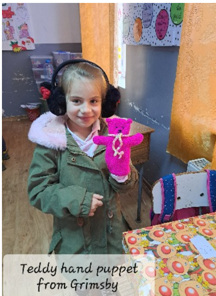
Teddy hand puppet from Grimsby